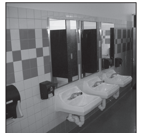
Before and After photos of one of the Measure B restroom renovations

McKinley and Washington, which opened in 1917, are the District’s oldest schools and while both buildings retain much of their historic architectural charm, the restrooms were in critical condition.